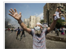
Chaos in Cairo